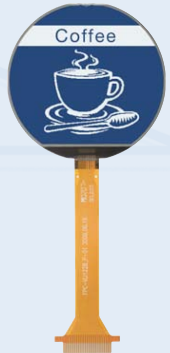
display for coffee machines

For advice regarding free shape LCDs and whether it is suitable for your application, please contact us, we will be happy to help. We can advise the right configuration including shape, format, technology and help you design your own personalized LCD.