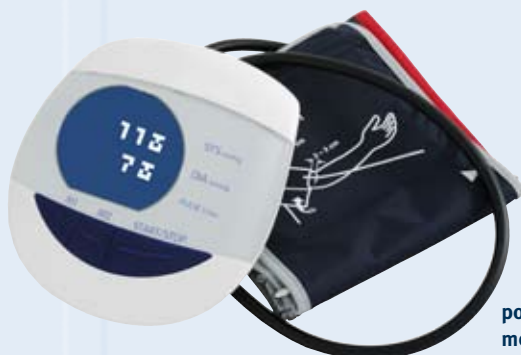
portable blood pressure measurement device